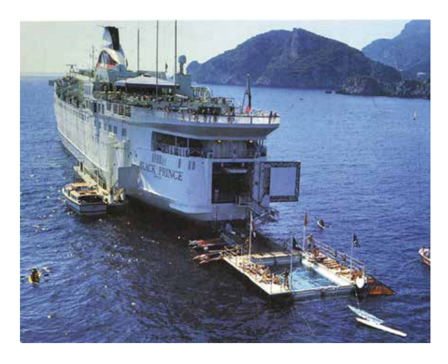
The Black Prince showing the marina floated out from her stern

base. After a brief but equally unhappy period as a ferry on the Copenhagen-Gothenburg route, she was put back on her Southampton to Canaries route in 1990, and later cruised very successfully to other destinations, quickly