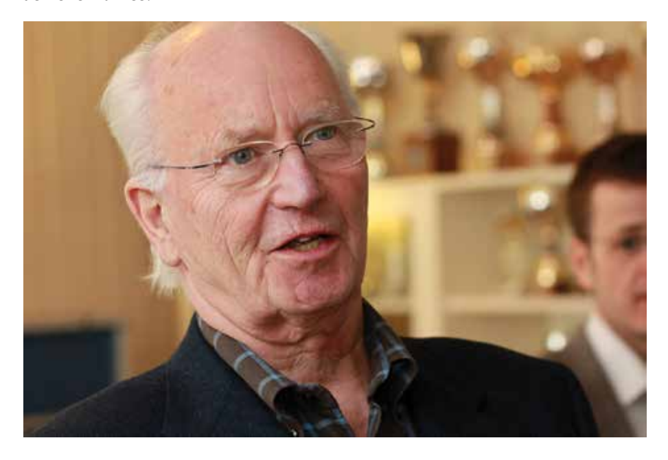
Thorvald Stoltenberg in 2011.

His career within the Labour Party was to show a steadily rising curve – State Secretary during the 1970s, then Defence Minister and finally Foreign Minister in the governments of Gro Harlem Brundtland in the 80s and 90s. His work, after a modest start as Vice Consul in San Francisco, also brought him prestigious diplomatic posts: Belgrade, Lagos, the United Nations. He was Norway's Ambassador to Denmark from 1996-99 and, as a humanitarian, served for three terms as President of the Norwegian Red Cross. But he was not destined to become Prime Minister, this was a position left for his son to achieve – twice!