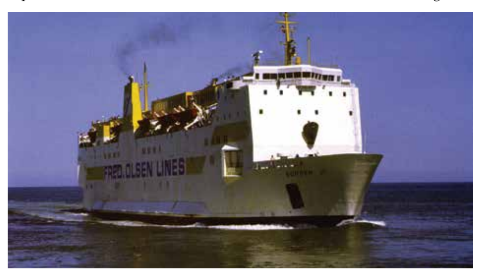
The less than elegant Borgen

The KDS route was so successful that in the 1980s the route was expanded to include both Hansholm in Denmark and Arendal, Stavanger