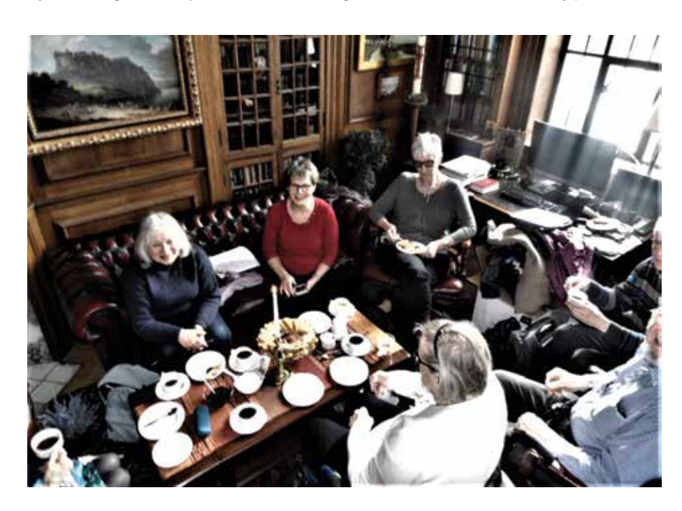
The writing group enjoying their coffee and waffles

Språk er et alvorlig emne. Det kan ha elementer av skam, av bryddhet og frustrasjon, likesåvel som glede. Det rører ved våre dypeste