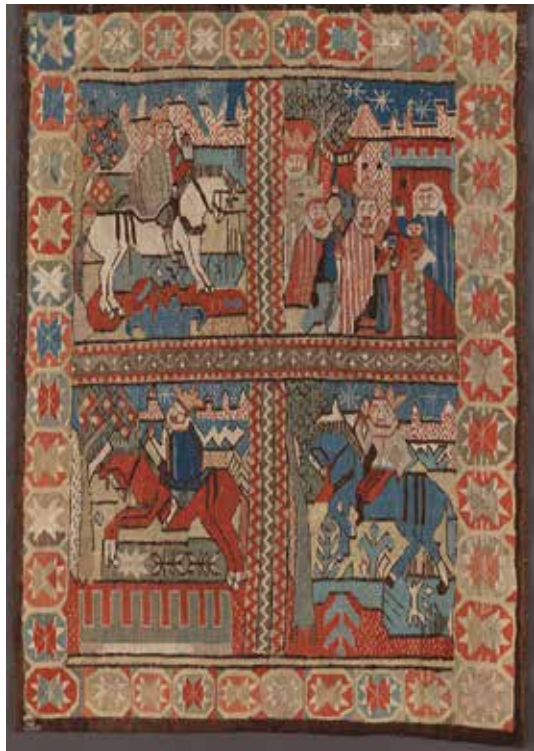
Tapestry from Gudbrandsdalen depicting the story of The Three Wise Men, 17th century.

An intriguing combination of tapestry weaving, legend and myth arose in Gudbrandsdalen in the seventeenth century. Through textile images local artists conveyed key stories from the Bible, but also knightly ballads from the middle Ages. Parallel to these