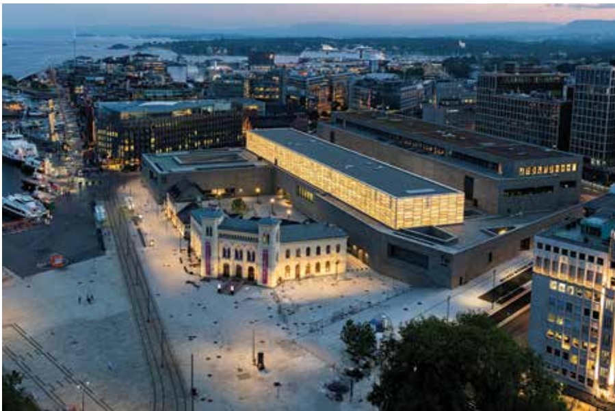
The new Nasjonalmuseet seen from above.