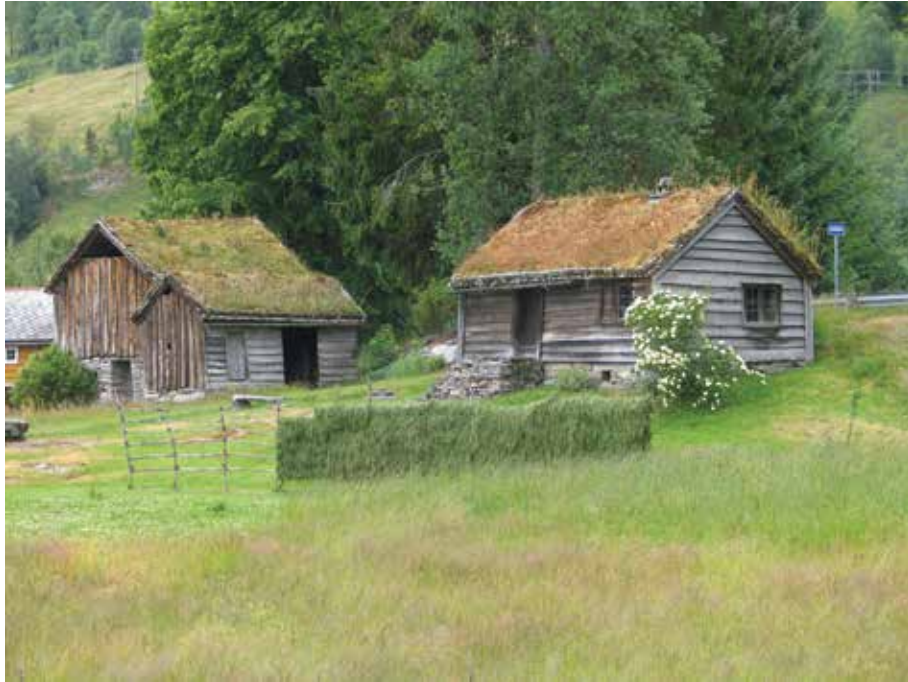
Husmannsplass Movika , Sunnhordland.

in some parts of the country, forestry, timber trade, mining and other industries in others, and to a more modest extent by the growing domestic urban markets of the epoch.