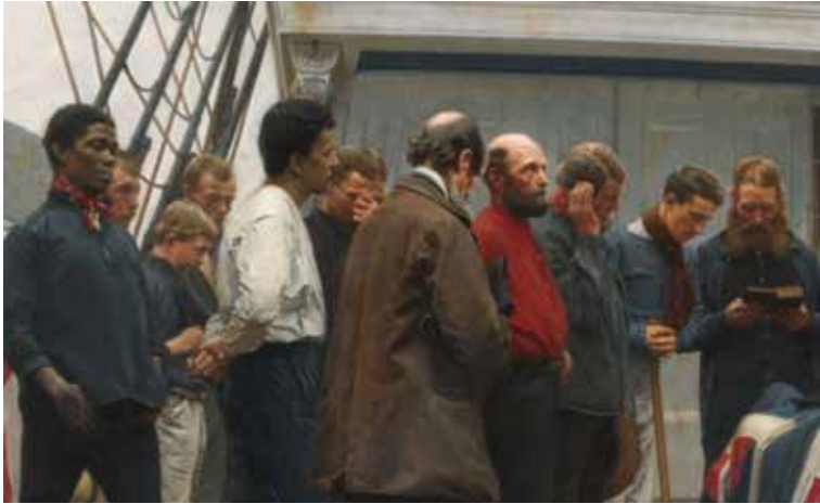
Carl Sundt-Hansen, Burial at Sea. (section), 1890.

shifts. For example I have long stopped and gazed at Werenskiold's Peasant Burial , but this time I suddenly became very aware of the painting hanging next to it: Carl Sundt-Hansen's Burial at Sea . Looking at it I became acutely aware of the two black figures standing there alongside other seamen and the dead seaman's widow, each involved in the service in their own way.