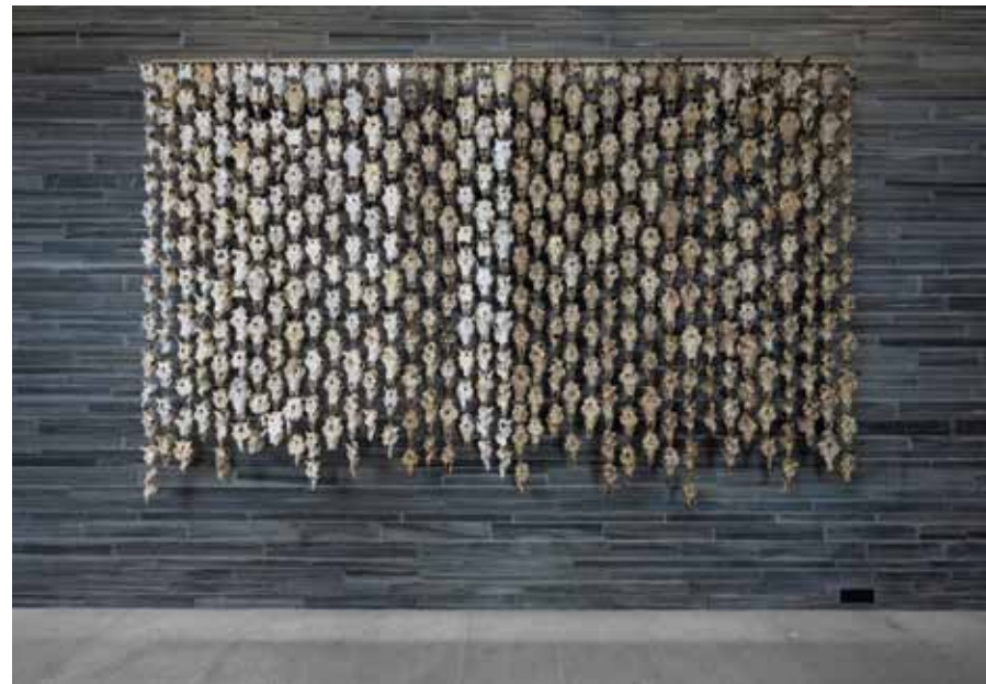
Maret Anne Sara's wall hanging Pile a' Sápmi .

Upstairs is divided into two main areas separated by a very spacious cafeteria, called salongen , with views out to the paved courtyard and the fjord beyond. The shorter, but fatter arm of the L-shaped building displays