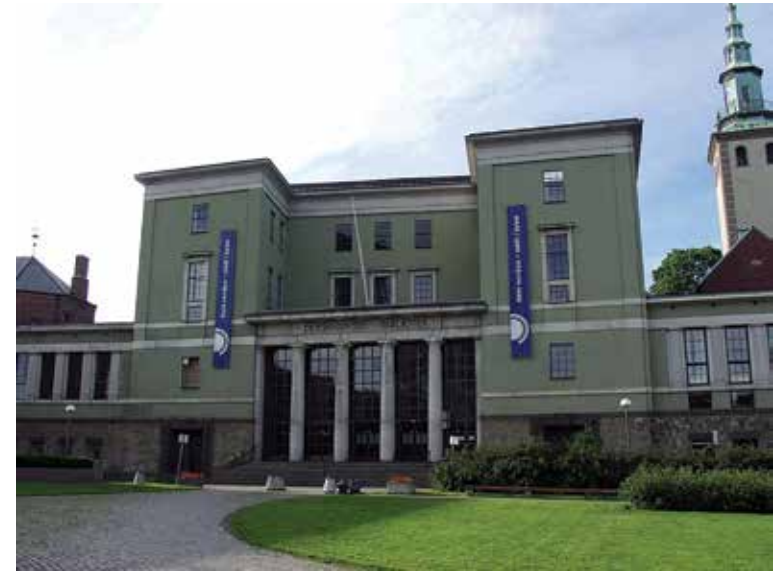
Deichmanske bibliotek. Av © 2005 J.P Fagerback - own work. Wikimedia Commons

The library had gone through several moves until 1933 when it acquired its own building and and moved into its penultimate home at Hammersborg. The architectural competition for this had been held between 1921 and 1922 and the building began in 1924, but for various reasons it was not completed till 1933. By that time according to the guide to Oslo’s historical building Arkitektur i Oslo it had begaun to look ‘ noe gammelmodig ’ - rather old fashioned.