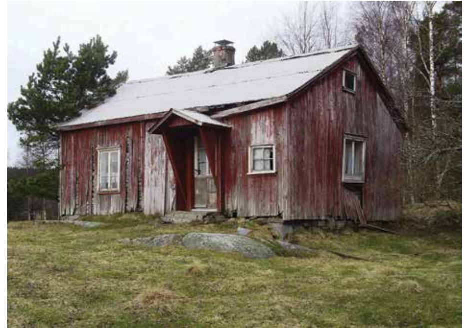
Halterikhytta , Mosen Hærland. The site was dug in 1670, so is one of the oldest in the area, though the building is from a later date.

Within the husmann institution of the eighteenth and