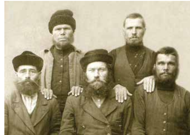
Russian merchants. Image supplied by the author. Date of image and photographer not known

(literally 'this crow-language'), but he 'admits' that he 'has only heard a few words of this Russenorsk . All of them contained ridiculous misunderstandings; still they were understood by both nations' (Daa 1870). Another author characterizes Russenorsk as 'a hodgepodge' and a 'Sjakersprog' (derogatory, 'barter-language'). In 1891 a writer calls Russenorsk 'a curious crow-language' which is 'neither fish nor fowl', and in 1905, Russenorsk is dismissed as 'an idiotic mixture of certain Norwegian, Russian and English words' (Helland 1905)