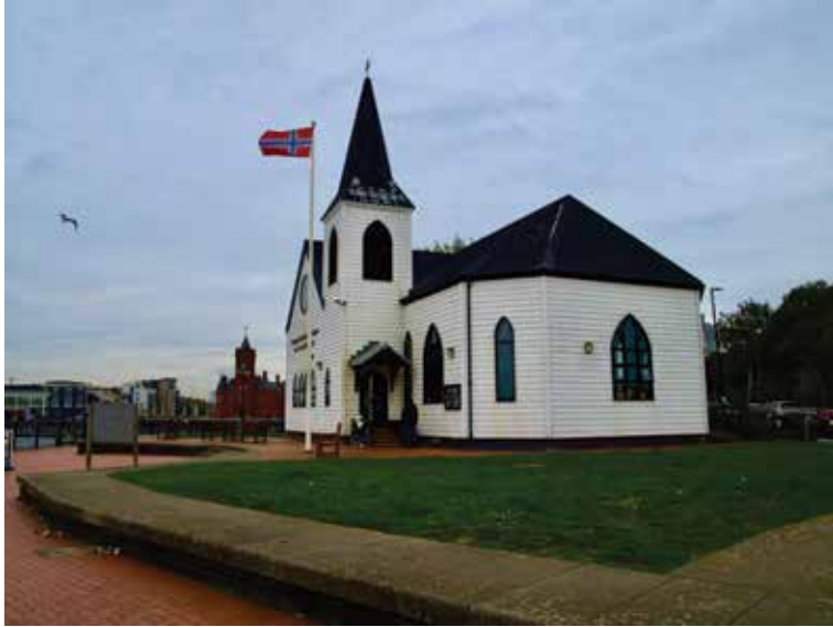
The Norwegian Church in Cardiff

history; a story of bonds between nations especially during times of war.