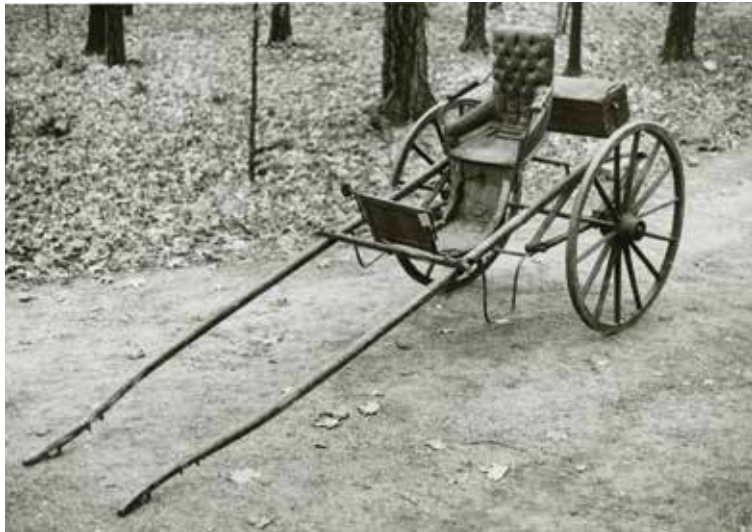
An early nineteenth century cariote

It is a curious-looking machine, this national carriage, but there is no