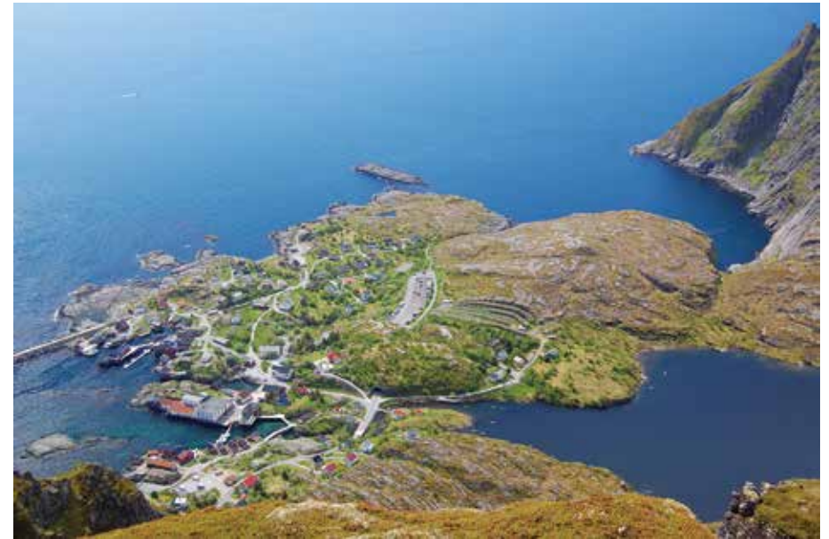
An aerial view of Å.

At Leknes we turned onto the E10, which runs all the way from Luleå in northern Sweden to the southern tip of Lofoten. We hopped over a bridge and I realised we had crossed onto Flak-stadøya, the next island. Suddenly the sea was on our right, a deep ultramarine blue, and we looked down upon a series of beautiful horseshoe bays fringed with white sand. It looked like the Caribbean. The next minute we were climbing over moorland again, the wind shivering the grass. Fjords cut deep between the serrated peaks, and then the sea had swung about and was on our left again. Hamnøy, Reine, Sørvågen... I made out the names of the villages as we passed through them, often just a tiny scattering of wooden houses that clung to the flat land of the shore. Then one more tunnel and we were reversing into a car park. The end of the road. Å.